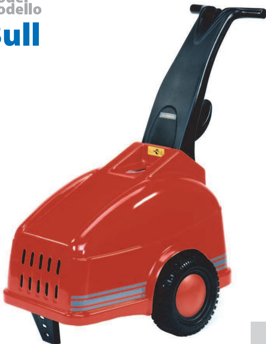
Dimensioni (cm) LxPxH: 69x50x95 Dimensions (in) LxWxH: 27x20x37